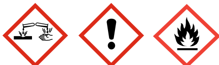
CORROSIVE EXCLAMATION FLAME

Signal word DANGER Hazard statement Combustible liquid. Harmful if swallowed. Causes severe skin burns and eye damage. Causes serious eye damage. May cause respiratory irritation. Precautionary statement Prevention Keep away from heat/sparks/open flames/hot surfaces. - No smoking. Do not breathe mist or vapor. Wash thoroughly after handling. Do not eat, drink or smoke when using this product. Use only outdoors or in a well-ventilated area. Wear protective gloves/protective clothing/eye protection/face protection. Response If swallowed: Rinse mouth. Do NOT induce vomiting. If on skin (or hair): Take off immediately all contaminated clothing. Rinse skin with water/shower. If inhaled: Remove person to fresh air and keep comfortable for breathing. If in eyes: Rinse cautiously with water for several minutes. Remove contact lenses, if present and easy to do. Continue rinsing. Immediately call a poison center/doctor. Wash contaminated clothing before reuse. In case of fire: Use appropriate media to extinguish. Storage Store in a well-ventilated place. Keep container tightly closed. Keep cool. Store locked up. Disposal Dispose of contents/container in accordance with local/regional/national/international regulations.