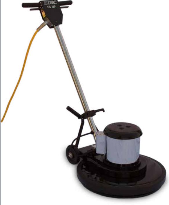
Detachable power cord at the motor for easy service and maintenance