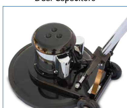
Optional 4 gallon shampoo tank