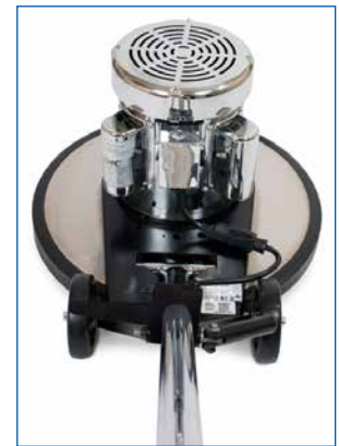
Quick disconnect pigtail