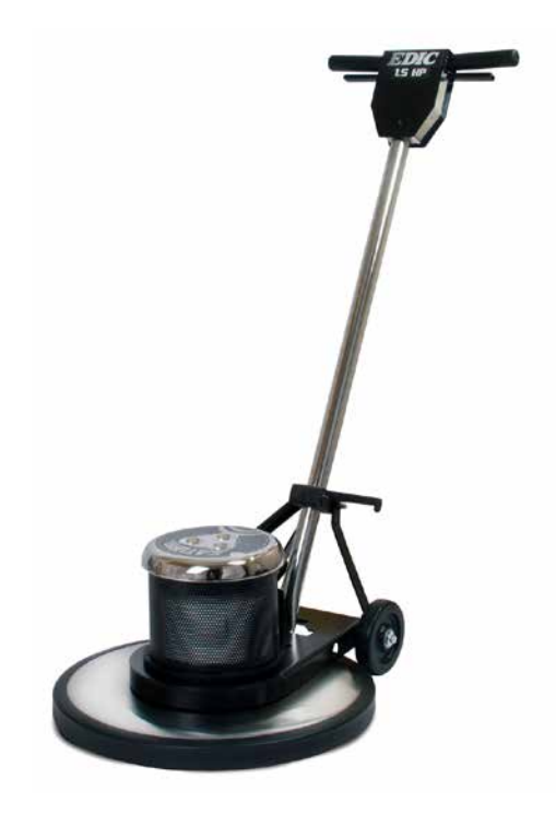
Detachable power cord at the motor for easy service and maintenance