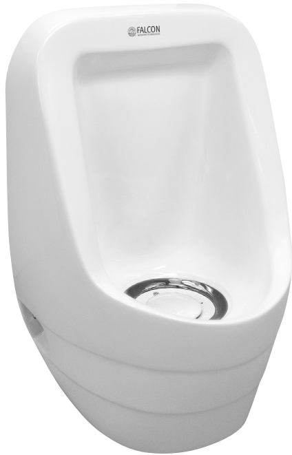
WATERFREE URINAL VITREOUS CHINA