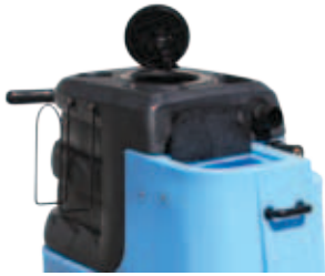
Large tank lids

The M-12 has two unique cleaning modes, to allow you to clean almost every surface in your building!