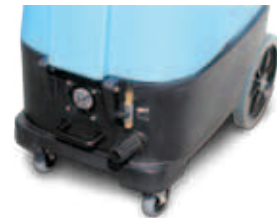
Prime valve & pressure regulator