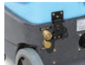
Auto fill and pump out