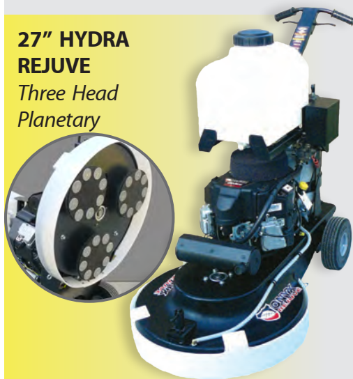
27" HYDRA REJUVE Three Head Planetary