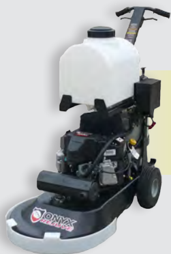
21" REJUVE Single Head