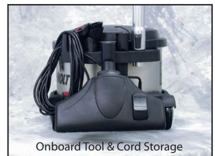
Onboard Tool & Cord Storage