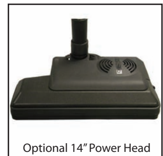
Optional 14" Power Head