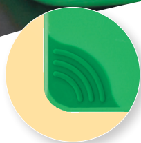
ANTI-SLIP GRIPS HOLD BOARD IN PLACE