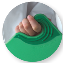
PATENTED FOOD SAFETY HOOK* FOR SANITARY TRANSPORT & STORAGE