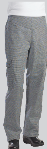
Ladies Cargo Pants LP001HT