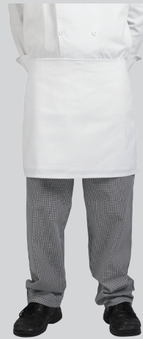
4-Sided Waist Apron 403FW