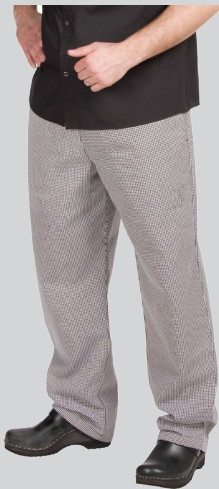
Baggy Pants P020HT