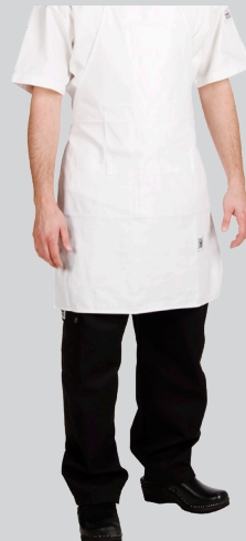
Crew Bib Apron 401BA