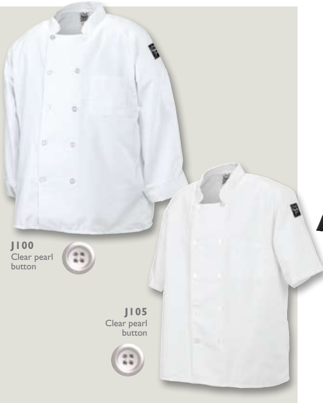
J100 Clear pearl button