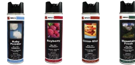
BABY POWDER #05030 BAYBERRY #05024