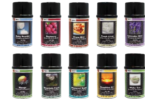
BABY POWDER #05259 BAYBERRY #05260 CINNA-MIST #05261 FRESH LINEN #05034 LAVENDER MIST #05032 MANGO #05204 MOUNTAIN FRESH #05268 PLEASCENT SCENT #05278 SUNSHINE AIR #05267 WHITE TEA #05033