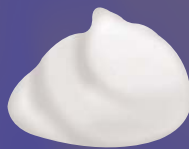
Foam soap from one push