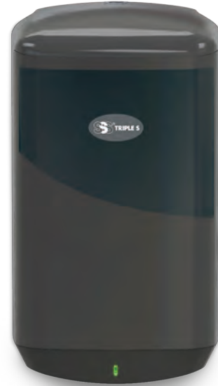
TFE ENERGY-ON-THE-REFILL AND COMMUNICATION CAPABLE

Touch-free systems built for reliable performance and maintenance ease.