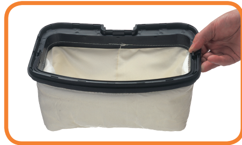
Standard 4 stage HEPA filtration filters down to 0.3 micron at 99.97% efficiency