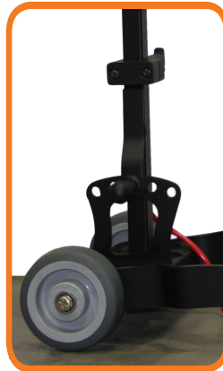
Exclusive 5-position pin set handle lock system

Wheels Down Technology allows the head to sit securely on the floor for better coverage.