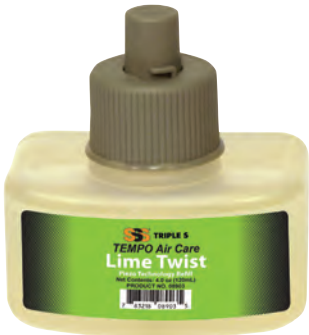
Lime Twist Piezo Technology Refill Item #08903

With Synchronized Scents Bring harmony to your facility's air care with fragrances that match and compliment other TRIPLE S restroom products.