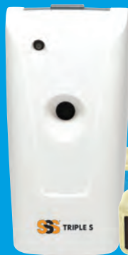
TEMPO Air Care System