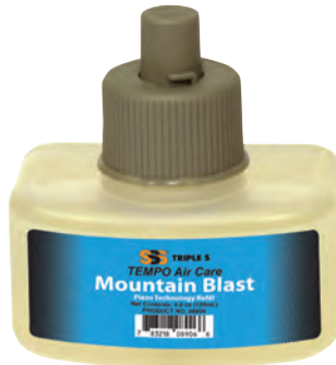
Mountain Blast Piezo Technology Refill Item #08906

Vibrant citrus orange, zesty tangerine, and white pomelo float over sweet strawberry accents, juicy mango, sugared plum, and glimmers of sun-ripened papaya.