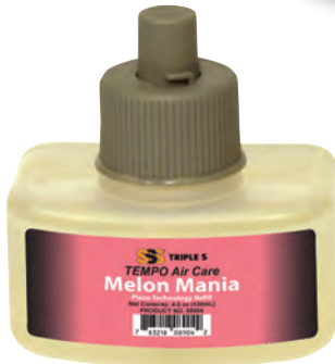
Melon Mania Piezo Technology Refill Item #08904

An enticing combination of vibrant lime juice and ripe Valencia orange swirls with vanilla bean and finished with dazzling sea salt.