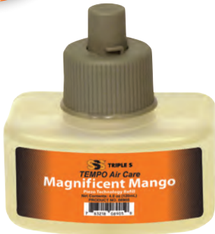
Magnificent Mango Piezo Technology Refill Item #08905

Sweet notes of frosted watermelon intermingle with fresh-squeezed lime and juicy pomelo over shimmering hints of tropical mango and luscious guava.