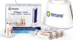
SAO mini Cartridges Item #LQFC204