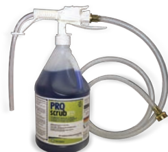
PROscrub RTD Item #LPS303 (dispenser sold separately)

NSF-certified safe for use around food, and with an SDS safety rating better than most deep cleaners and degreasers, PROscrub is ideal for virtually any hard surface including ceramic, tile, metal, industrial flooring, and heavy-duty equipment. It's particularly effective on grout and in other crevices where dirt and grime have accumulated over time.