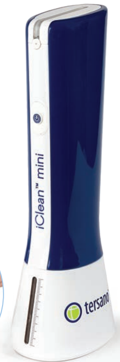
iClean™ mini Item #LQFC200

* For more information on sanitizing test results, please visit www.tersano.com .