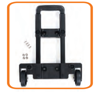
Optional Transport Kit