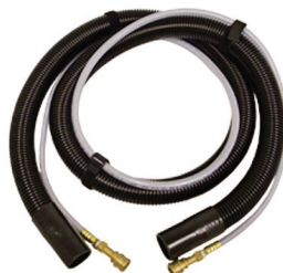
7-Foot Vacuum and Solution Hose Included