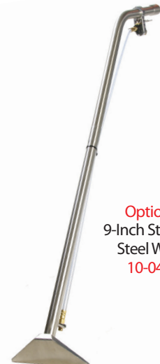
Optional 9-Inch Stainless Steel Wand 10-0455