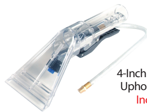
4-Inch Clear View Upholstery Tool Included