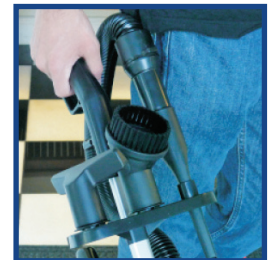
Handle-Mounted Tool Kit